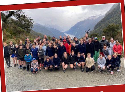
Year 8 Deep Cove Camp