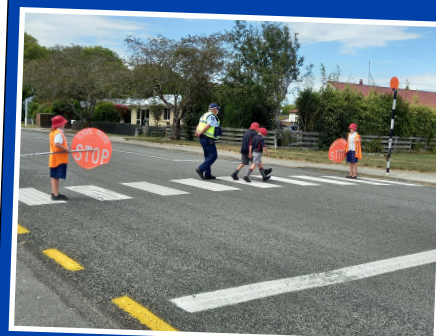
Road Patrol Training