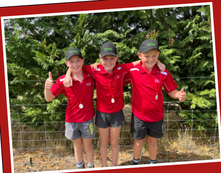
Agri Kids Team